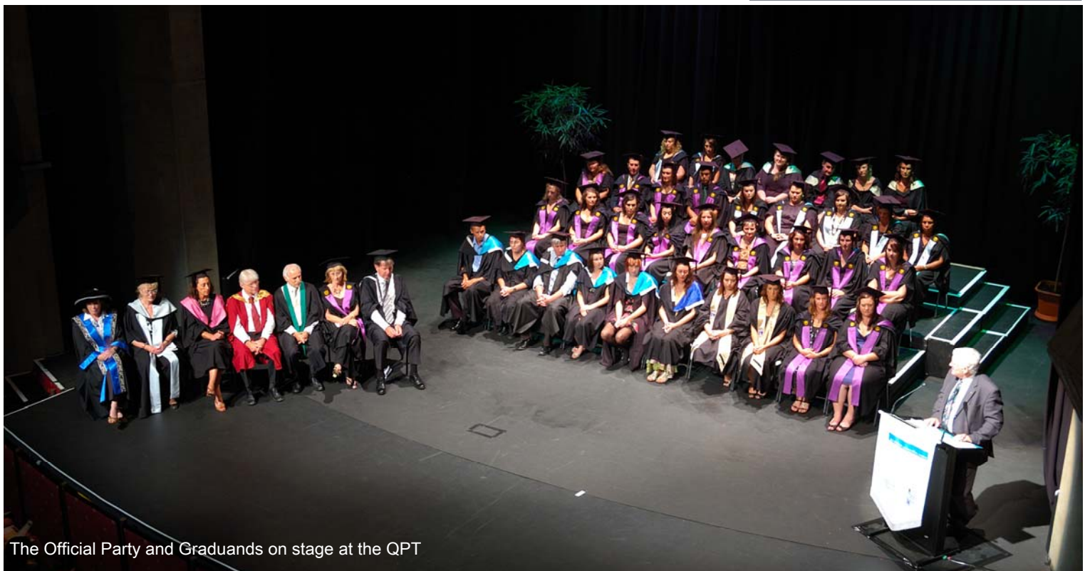
The Official Party and Graduates on stage at the QPT