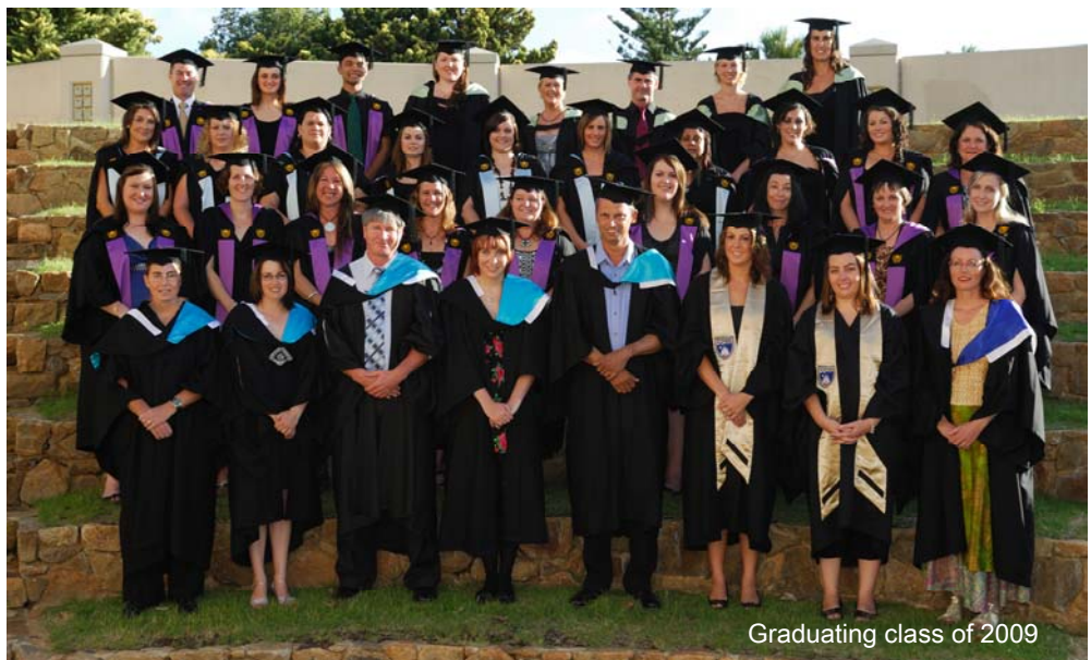
Graduating class of 2009